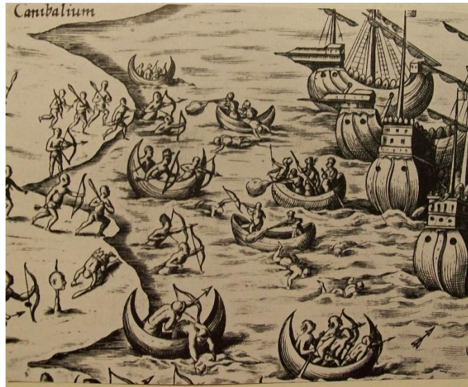
Spanish land in Jamaica (early 1500s)